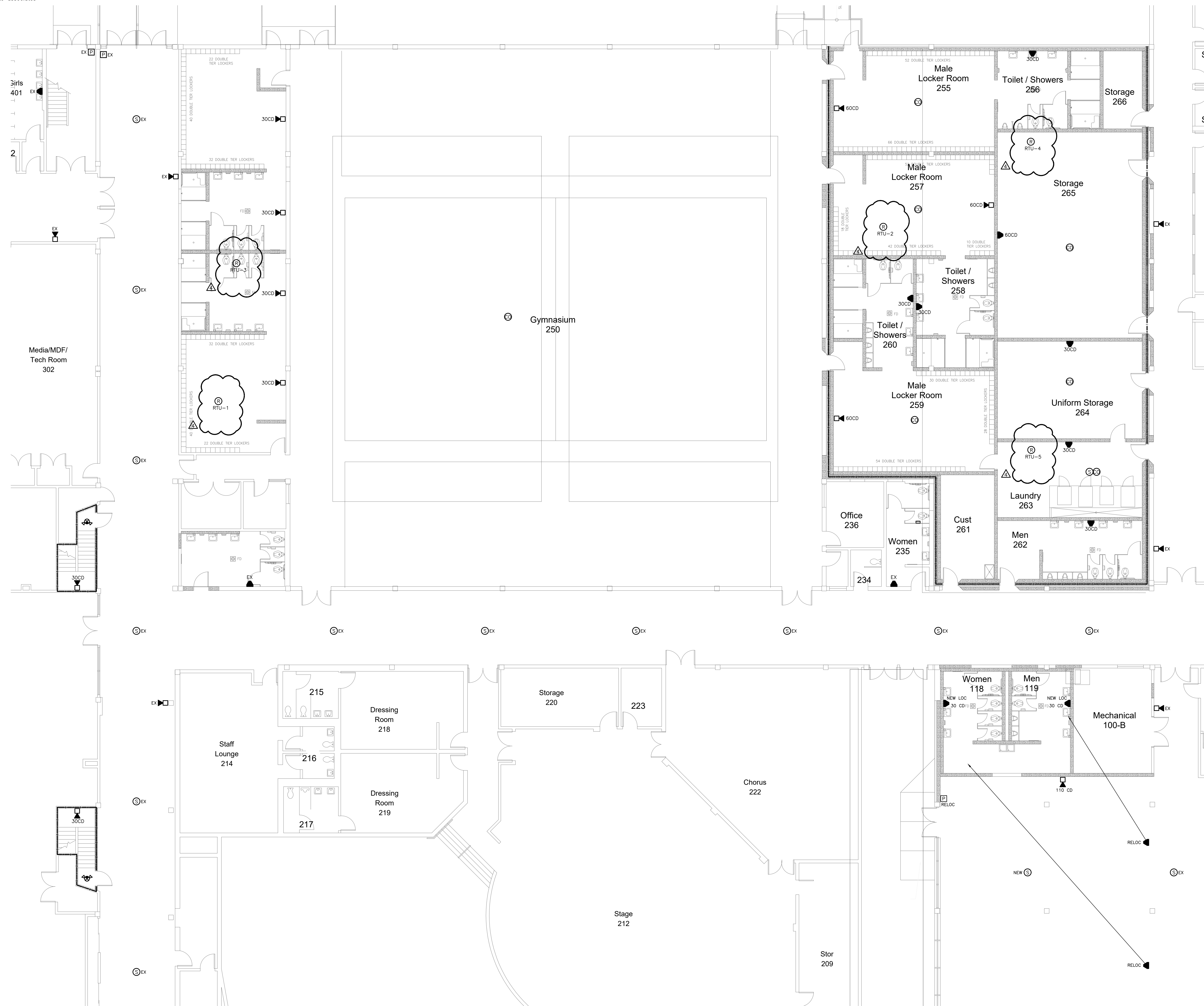
201.1 LOCKER ROOM FIRE ALARM PLAN SCALE: 1/8" = 1'-0"