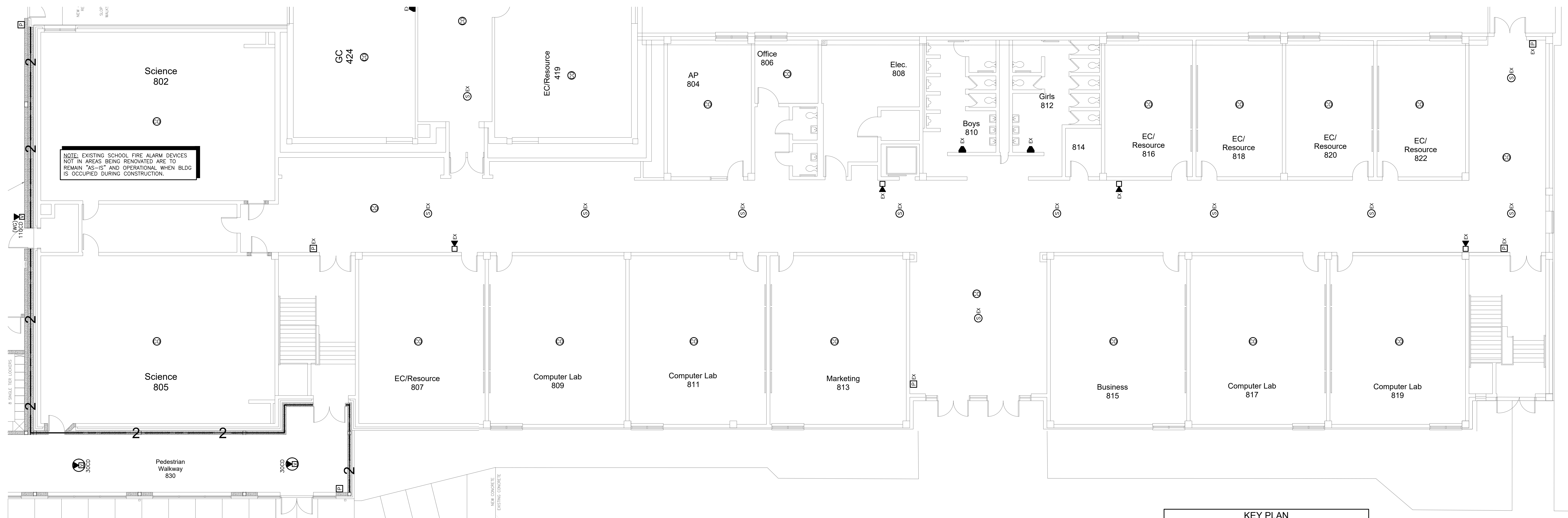
801.1 800 BUILDING FIRE ALARM PLAN SCALE: 1/8" = 1'-0"